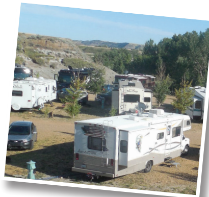
Dinosaur Trail RV Resort & Cabins DRUMHELLER, AB 403-823-9333 JUNE 8 & 9