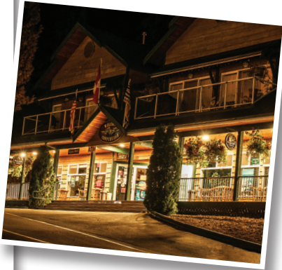
Camperland RV Resort & Cabins BRIDAL FALLS, BC 604-794-7361 JUNE 1 & 2

We were excited to celebrate our 35th anniversary in 2018! We look forward to you joining us in the Spring of 2019 for our 36th year at your Member Appreciation days. Mark your calendar!