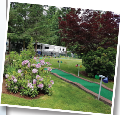
Country Maples RV Resort CHEMAINUS, BC 250-246-2078 JUNE 15 & 16