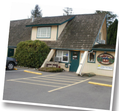
The Cedars RV Resort FERNDALE, WA 360-384-2622 MAY 25 & 26