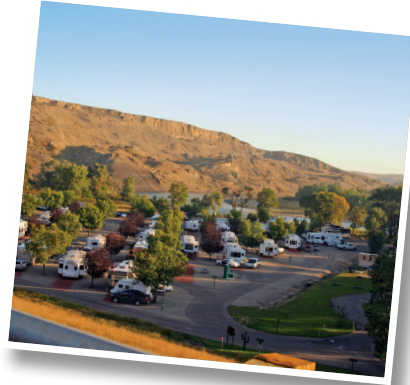
Bridgeview RV Resort LETHBRIDGE, AB 403-381-2357 JUNE 8 & 9